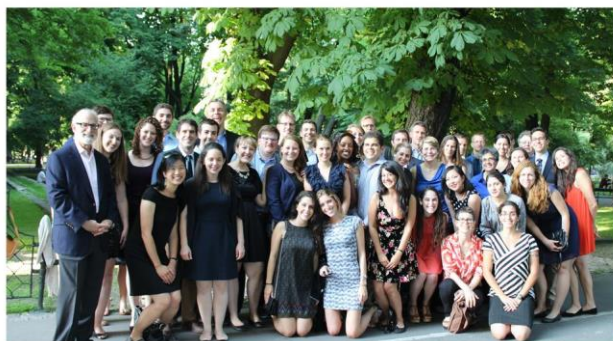
2015 Law, Journalism, and Business Fellows