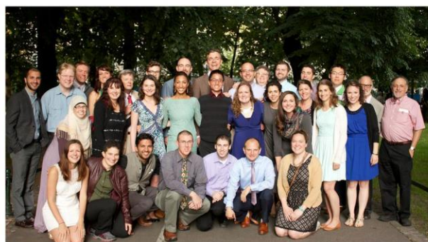
2015 Medical and Seminary Fellows

FASPE ran five programs in the summer of 2015, working with Journalism, Law, Medical, Seminary, and a new pilot program of Business Fellows. The Business Fellows traveled with the Journalism and Law Fellows. Given the inclusion of five European Fellows and one European faculty member, we started the program in Berlin this year,