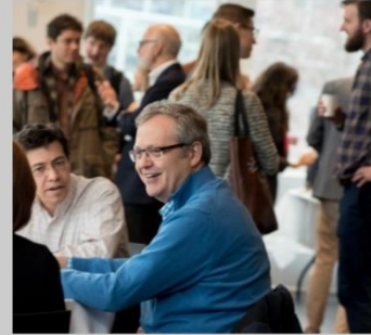
Photos from the Annual FASPE Reunion & Symposium. Find more at this link .