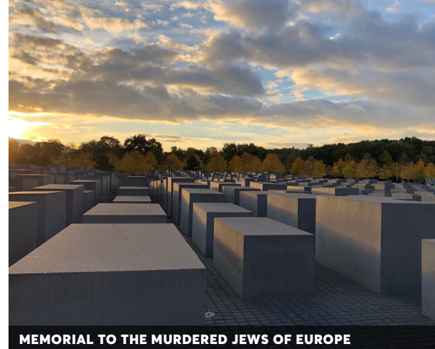
MEMORIAL TO THE MURDERED JEWS OF EUROPE