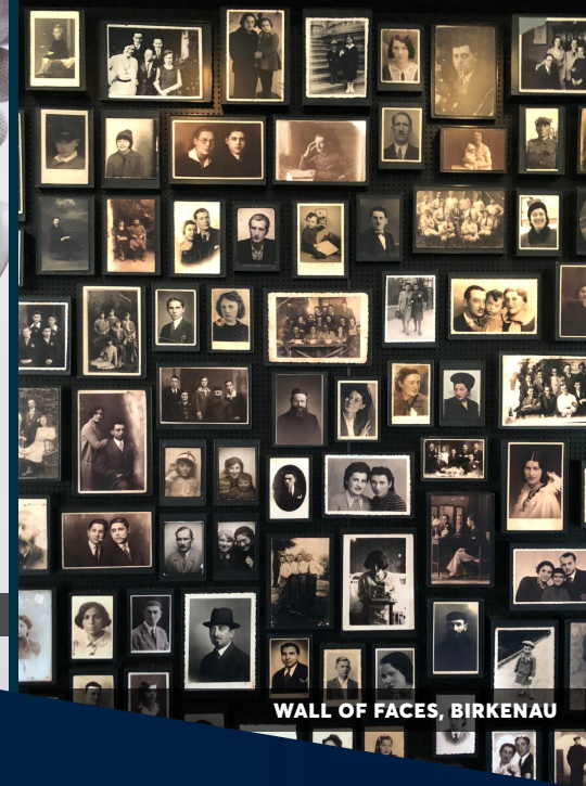
WALL OF FACES, BIRKENAU

While learning about the actions and motivations of the professionals in Nazi Germany, faculty and participants engage in daily lively seminars and informal conversations about ethical issues that face the professions today —such as: