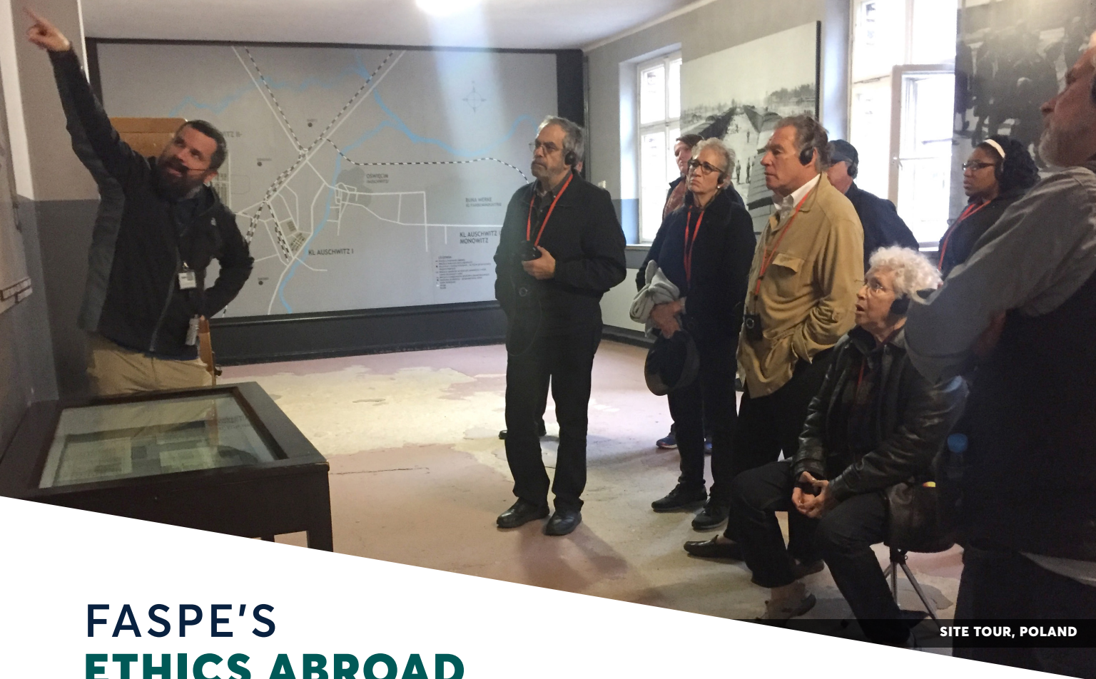
SITE TOUR, POLAND