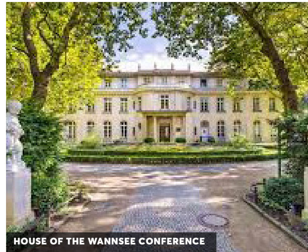
HOUSE OF THE WANNSEE CONFERENCE