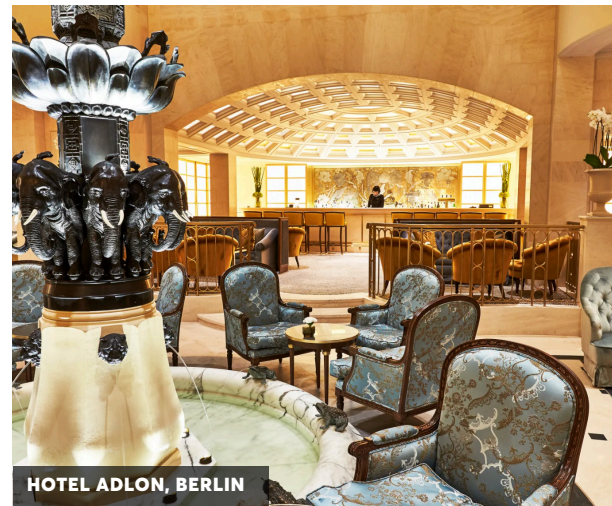
HOTEL ADLON, BERLIN