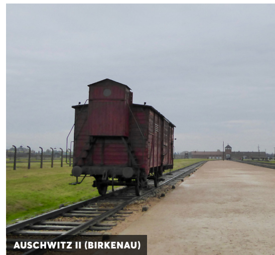
AUSCHWITZ II (BIRKENAU)