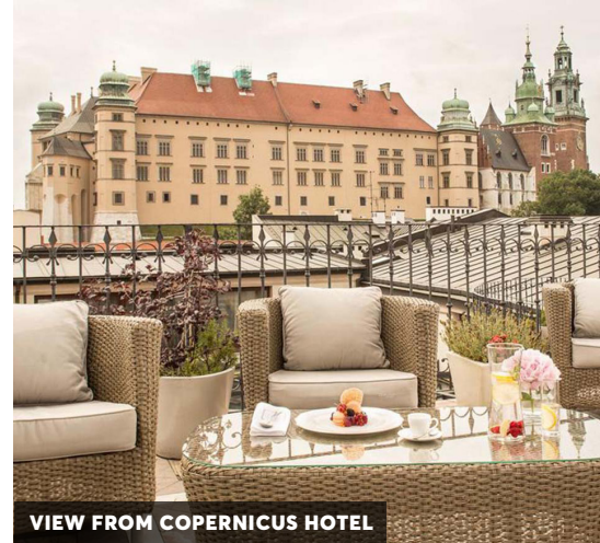
VIEW FROM COPERNICUS HOTEL