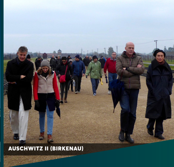
AUSCHWITZ II (BIRKENAU)