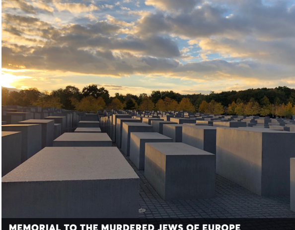
MEMORIAL TO THE MURDERED JEWS OF EUROPE