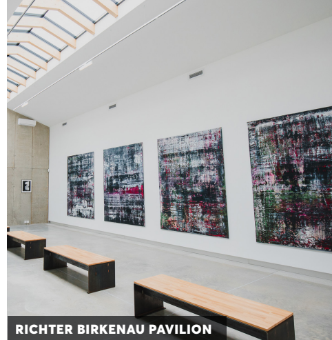
RICHTER BIRKENAU PAVILION