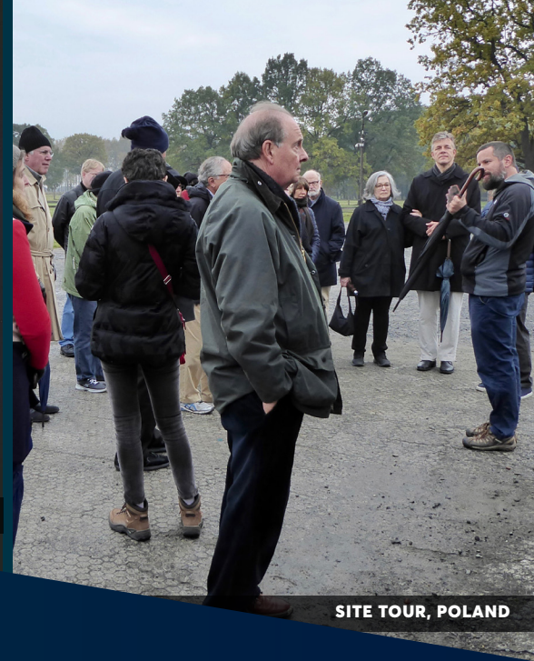
SITE TOUR, POLAND

COST INCLUDES LUXURY ACCOMMODATIONS AND A CAREFULLY CURATED EXPERIENCE.