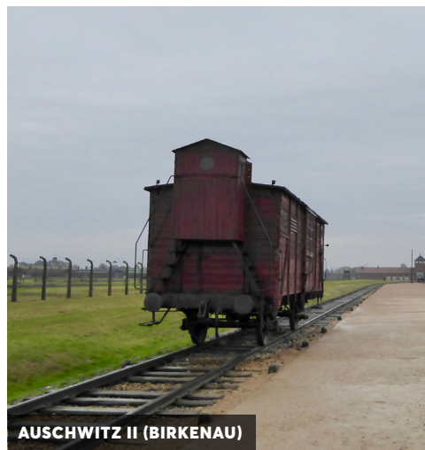
AUSCHWITZ II (BIRKENAU)