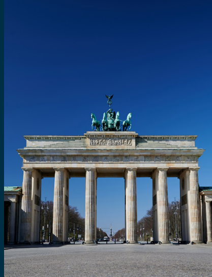
BRANDENBURG GATE, BERLIN