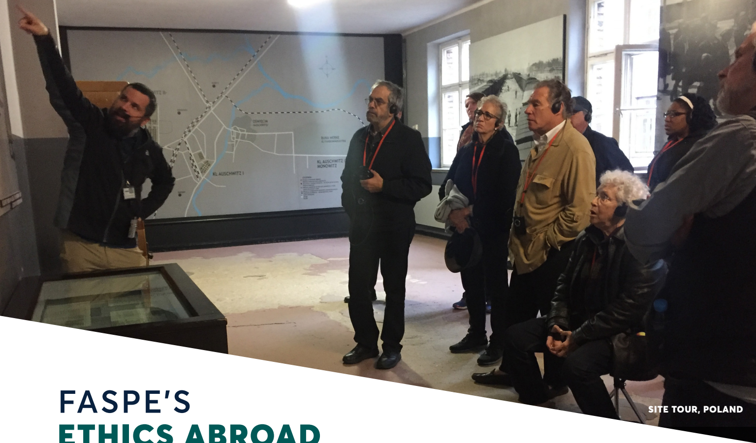
SITE TOUR, POLAND